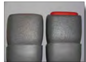
A comparison of the Gen 2 and Gen 3 seat belt buttons. The Gen 3 had a button that protruded from the cover.

One example was the Gen 3 seat belt installed in more than 14 million DaimlerChrysler cars and minivans, including the one Bart Moran was driving. The Gen 3 had a button that protruded over the button cover, allowing it to be accidentally depressed by a flailing arm or loose object. At least 15 deaths and 18 serious injuries were caused by its malfunction. Even after Chrysler's engineers identified the problem and recommended a newer, safer seat belt, the car manufacturer continued to use the Gen 3 in many models, often in the back seat.